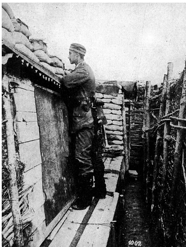
Standing in the Trench

Tiny rooms, called dugouts, were tunneled sideways into the dirt. Officers slept in dugouts which offered shelter from wind and rain. The Germans built superior dugouts. Because they planned on maintaining their position for a long period of time, they dug up to thirty feet below ground, lined the bunkers with concrete, and installed electric lights, wallpaper, carpets, and