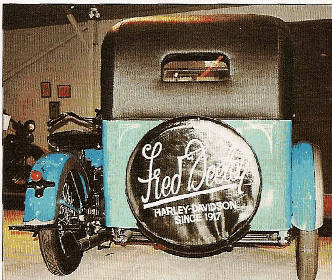
This 1935 Sidecar Taxi is the only surviving model of the two that were built in Bellingham, Washington.

After a few miles, you'll be convinced—as I was—that Vancouver's curve-happy, undulating roads were made to mimic the dramatic mountain views that they embrace. But with the lushness of forested coastlines and the finicky winds over Pacific waters comes wet weather. So, if you wake up to overcast skies during your visit to the Pacific Northwest—you should definitely count on rain—and don't feel like braving ubiquitous run-offs, stop in at the Trev Deeley Motorcycle Collection near downtown Vancouver.